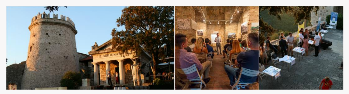
The PAR Entrepreneurial Camp gathers young aspiring entrepreneurs and provides them with an opportunity to meet mentors and investors.

PAR organizes many events with the goal of introducing global trends and presenting modern business notions in the city of Rijeka. One of such events is the PAR Entrepreneurial Camp (PAR Camp) , aimed at promoting the startup culture .