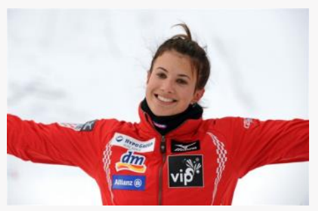
Ana Jelušić , Croatian ski representative, now employed by the International Olympic Committee was one of first students of the Sports Academy.