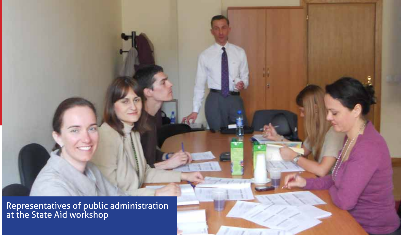
Representatives of public administration at the State Aid workshop