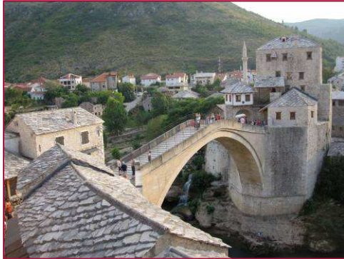
Hercegovina- Neretva Canton