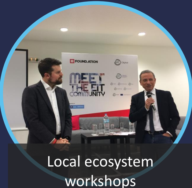
Local ecosystem workshops