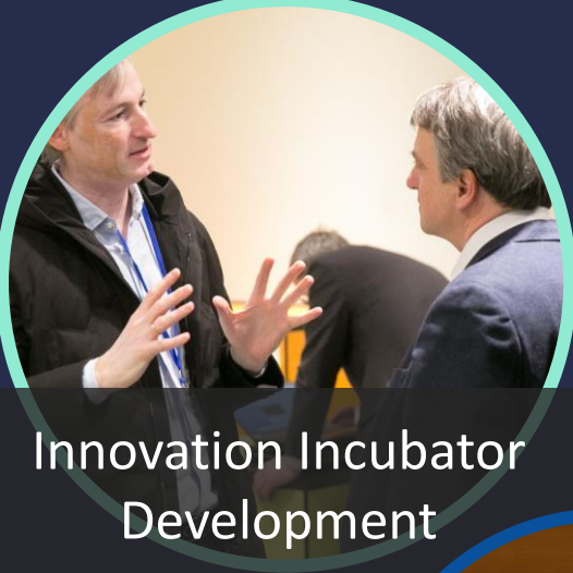
Innovation Incubator Development